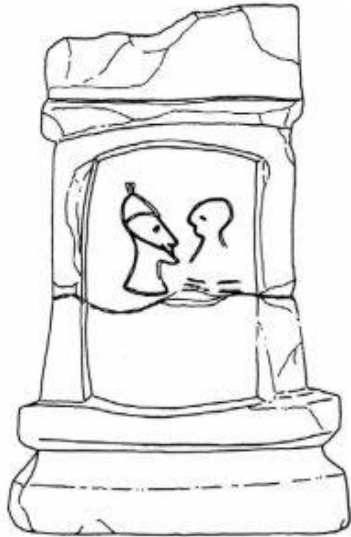
Figure 4. Stele from the Tophet of Tharros, Sardinia (no. 142; Mascati & Uberti 1985: fig. 23 and pl. LVI). The stone ranges in height between 31.5 and 28.8cm and between 20.7 and 14.7cm in width.

Image of a priest and child from the Tophet at Tharros, Sardinia